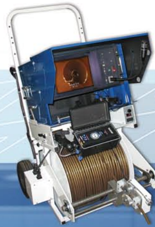
K2 Dolly-Mounted with DV-1 Touch DVR