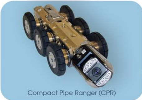
Compact Pipe Ranger (CPR)