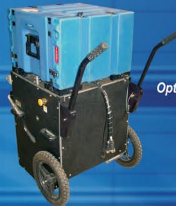
Optional Heavy-Duty Handles