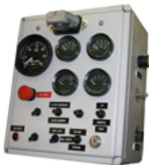
NEMA4 Control Pannel