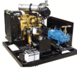
Power Plant Sub Assembly